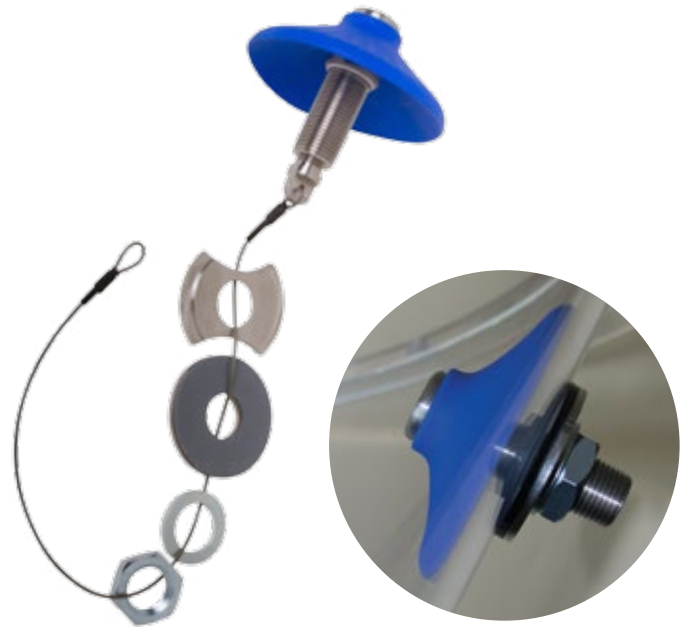
Kit components Shown with Install Tool.

Insist on genuine Solimar disks with the trademarked Radial Ridge Design