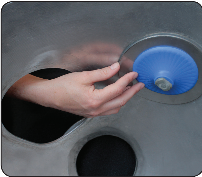
E-Z Out Access Door opening.

Pneumatic Trailers, Storage Silos, Dust Collectors and Process Equipment